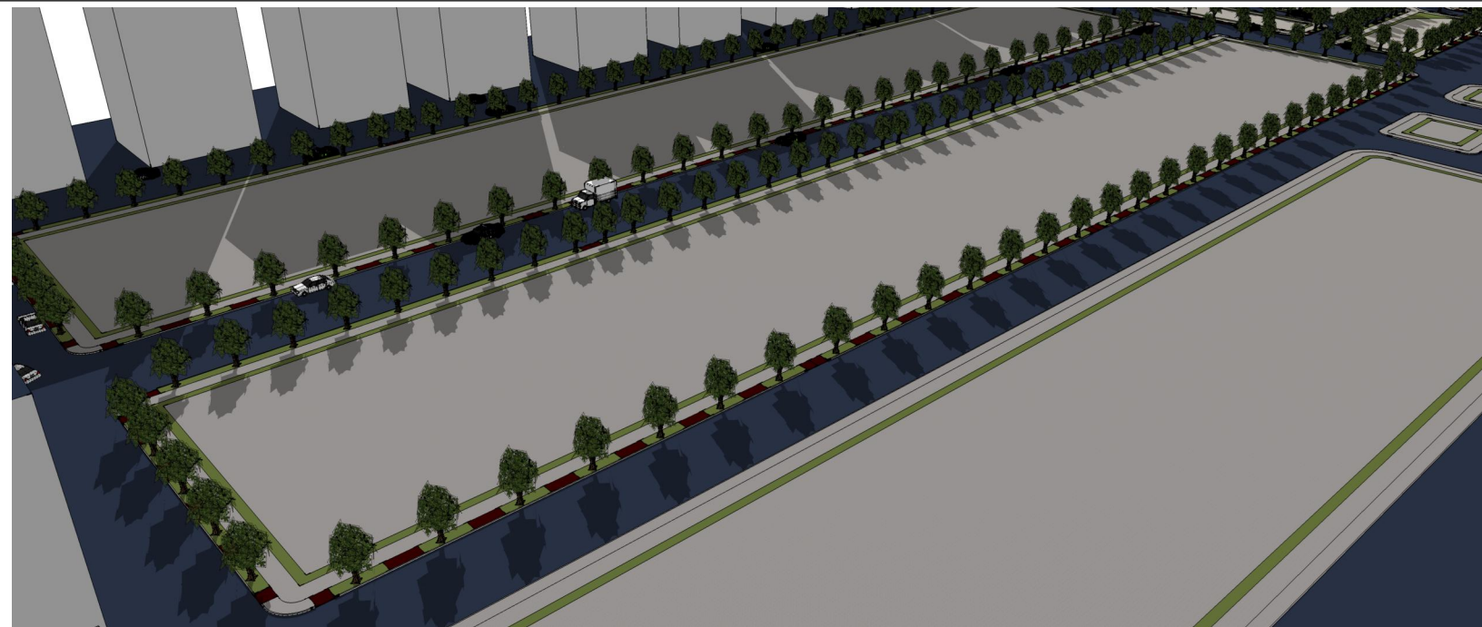
3 BLOCK 01 033 - NORTHEAST VIEW G-004.41 SCALE: N.T.S